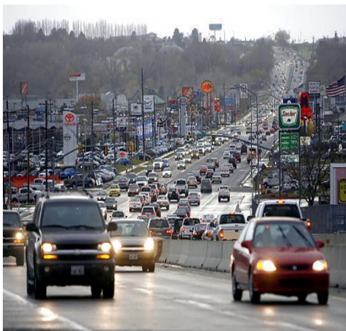
Riverdale Road in Ogden Utah.

Riverdale Road is a congested non-freeway corridor in Ogden, Utah (see photo below) that carries about 47,000 vehicles a day. Commercial activity in the corridor is significant with shopping areas on both sides of the road for large portions of the corridor, especially on the western side, gradually reducing in density west to east. This segment is primarily a 6-lane road with 11 traffic signals.