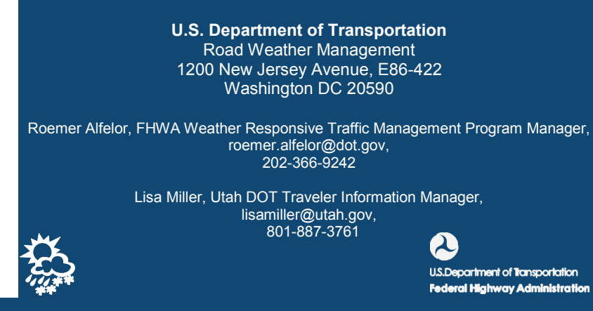
"Anytime, Anywhere Road Weather Information"

All photos unless otherwise attributed are courtesy of the Federal Highway Administration Road Weather Management Program.