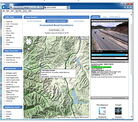
Figure 2. Utah DOT Traffic Operations Website

Make appropriate software changes to manage the additional data and forecasts and dis-